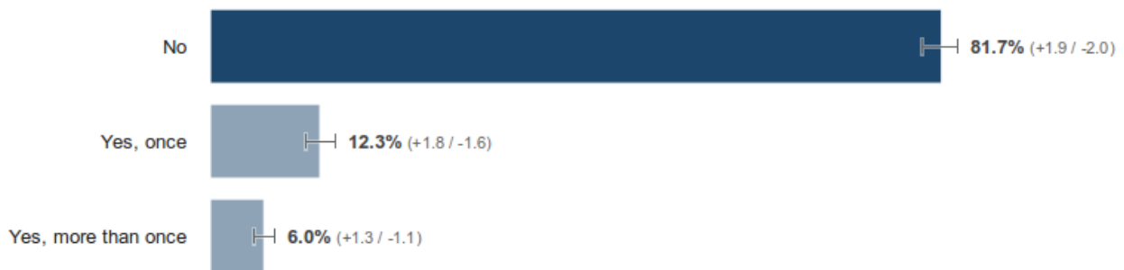
Figure 1. Answers in the UK to the question Has anyone ever broken into any of your online accounts including email, social network, banking, and online gaming ones?

Initially, we wanted to test if the somehow surprising findings [1] of Google security researcher Elie Bursztein on the USA population were applicable to the UK. Our results, obtained using Google Customer Surveys, show that they are, indeed. When asked the question “Has anyone ever broken into any of your online accounts including email, social network, banking, and online gaming ones?” a surprising 18.3% (or approximately 1 in 5, virtually identical to the 18.4% found by Bursztein) answered positively. Even more worrying is possibly the fact that 6% of those surveyed said this had happened more than once (for 6.4% for USA-Bursztein). The results of this survey can be seen below in Figure 1.