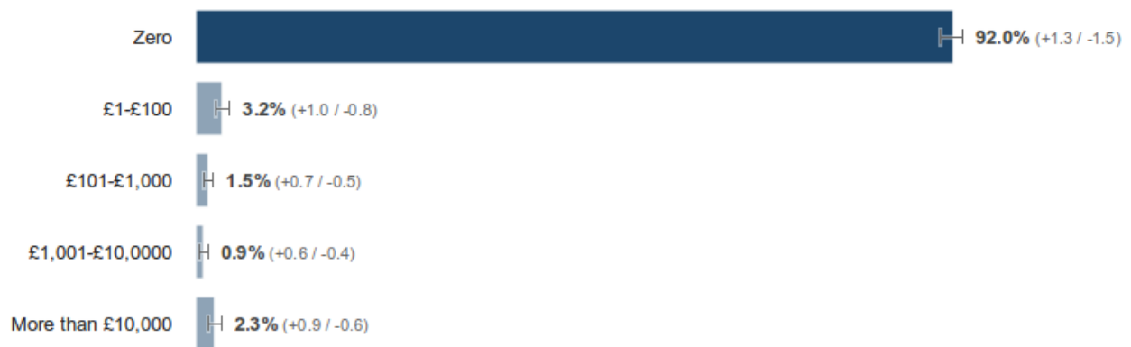
Figure 3. Answers in the UK to the question How much money have you lost in the last year due to any kind of computer criminal activity?

We tried to gain a better grasp on how cyber crime is affecting average citizens by running one last survey that delved into the topic opened by the last question. We asked “How much money have you lost in the last year due to any kind of computer criminal activity?” and the results were quite shocking (see Figure 3).